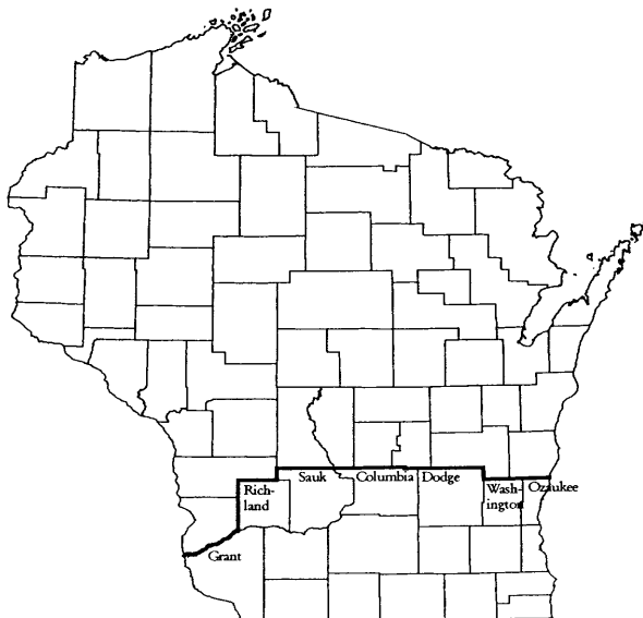
Alternate 4% g Contour Location

History: CR 00-179: cr. Register December 2001 No. 552, eff. 7-1-02.